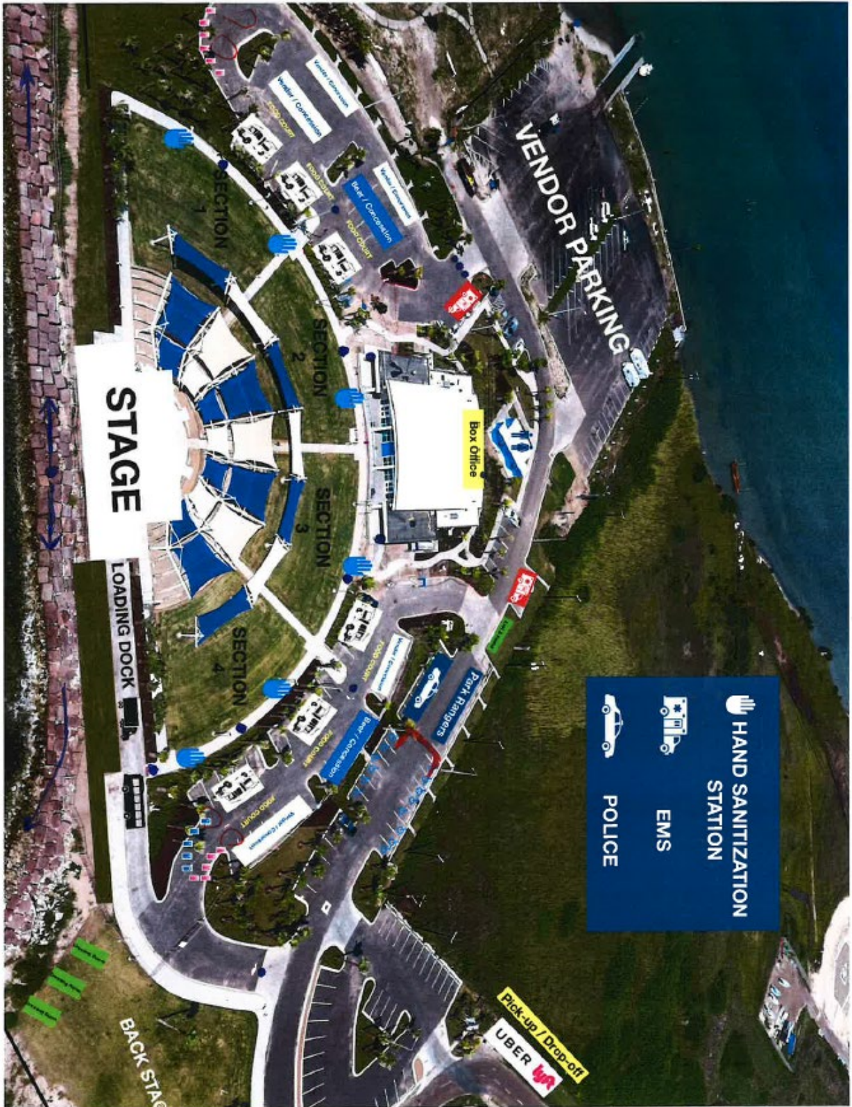
EXHIBIT "A" AMPHITHEATRE EVENT AERIAL MAP