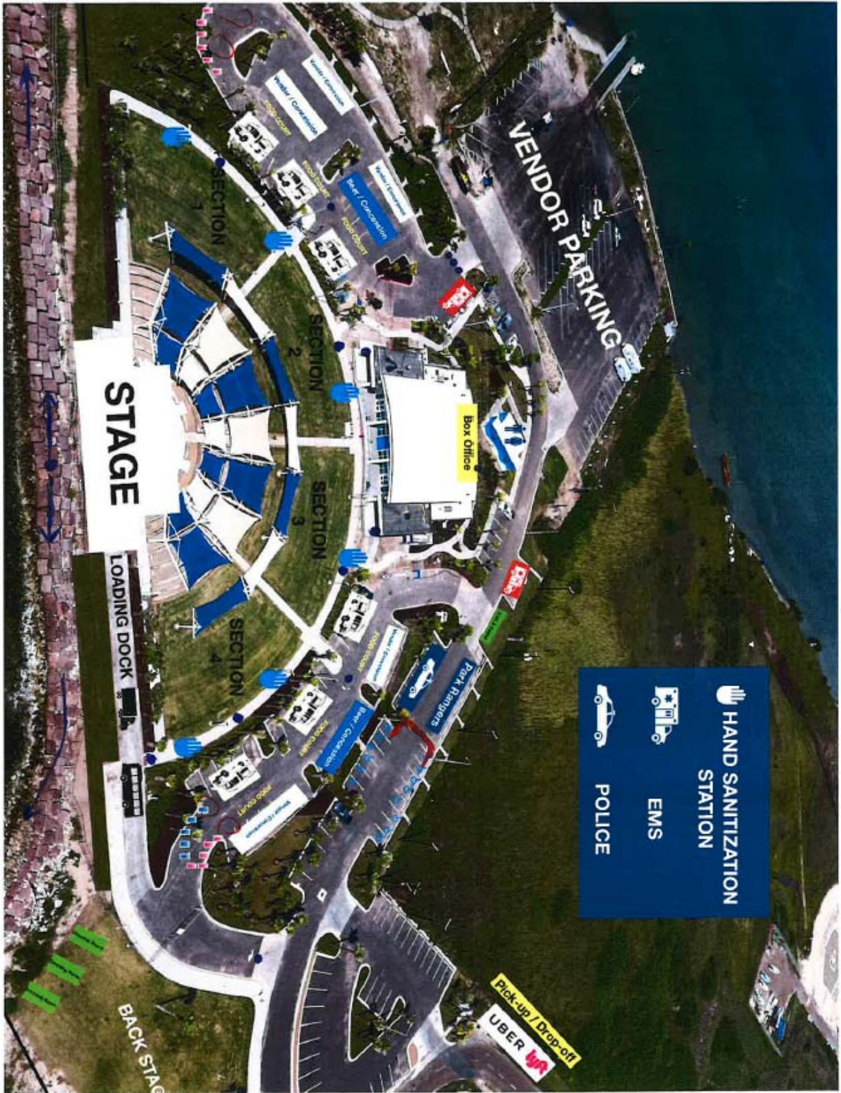
EXHIBIT "A" AMPHITHEATRE EVENT AERIAL MAP